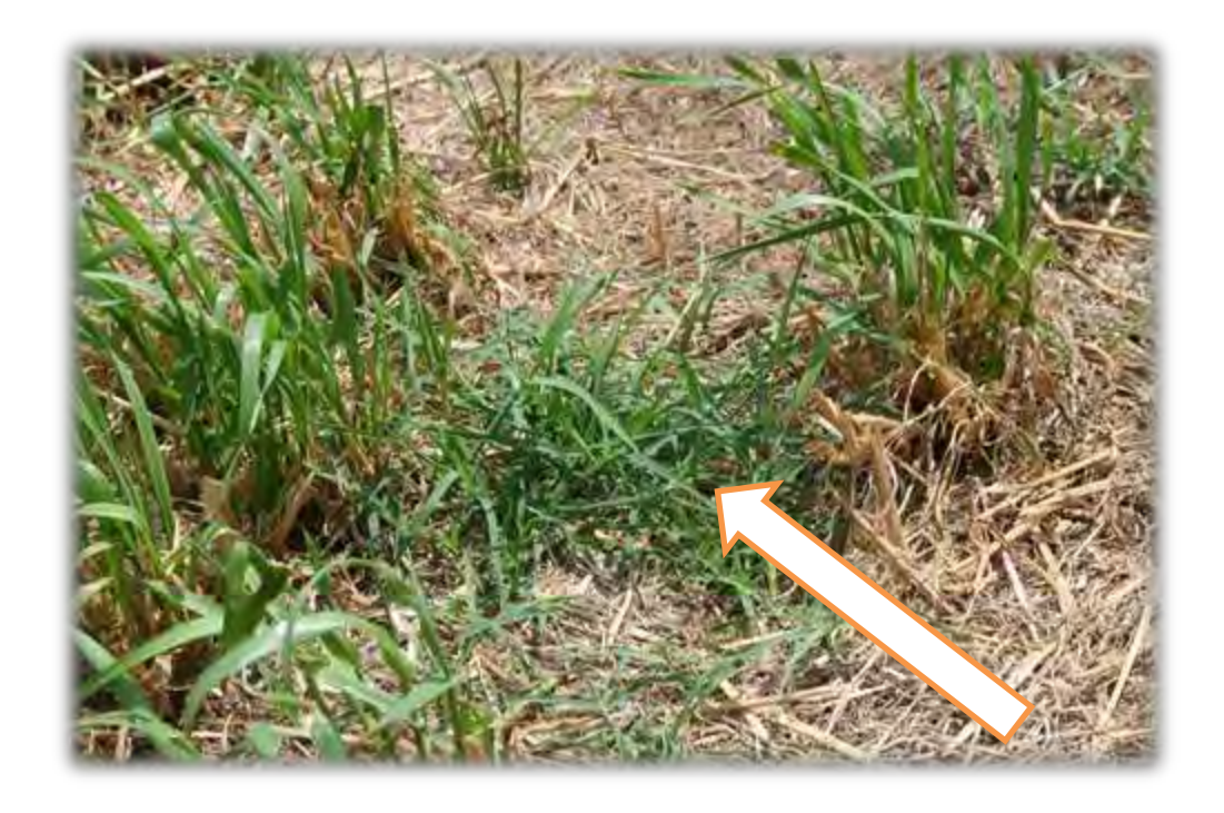
Figure 1. Bermudagrass (center clump by arrow) affected by annual ryegrass overseeding in warm spring (surrounding clumps).

spring to guarantee the light conditions that warm-season grasses require. Controlling the cool-season peak growth can be achieved through a combination of methods targeting removal of the cool-season grass early in the spring season. The challenge is to manage the onset of early warm-season conditions when you want to maximize the production of cool-season annuals like ryegrass.