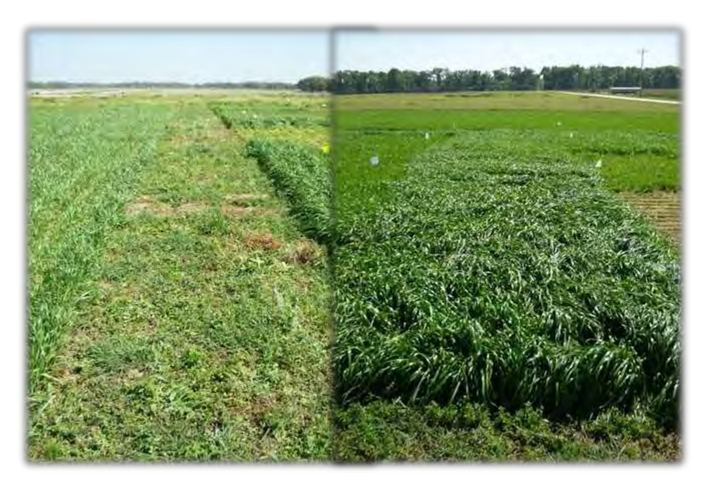
Figure 2. Bermudagrass in Spring with no cool-season competition (left). Ryegrass canopy with potential damaging shading effect over bermudagrass if not removed in a timely manner (right).

annuals such as annual ryegrass into permanent pastures may present some problems if not properly managed. Excessive growth if not controlled through timely mowing or grazing will create a severe shading competition condition that will affect the emerging warmseason grass in spring (Figure 2)