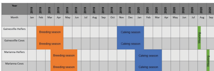
Figure 1. Calendar distribution of the breeding season (orange), calving season (blue), and weaning (green bar) on the UF/IFAS beef herds. In both herds, the breeding season starts when females are artificially inseminated, following a synchronization protocol (Figure 2). Bulls are introduced a few days after AI (Table 1) and removed at the end of the breeding season. The calving season is consistent with the average gestation length in cattle (283 days). Because all females are inseminated on day 1 of the breeding season, AI calves are born first and calves from natural service follow.

Producers always ask what numbers they should aim for. There is no definitive answer, because different performances are expected from different production systems. Producers may find it useful to utilize the numbers from this report as a reference point to gauge the reproductive performance of their operations. To that end, it is always useful to look at real numbers obtained from reliable sources. Here, we present a yearly report of the reproductive performance of the University of Florida beef herds. Each University herd operates according to its respective regional characteristics and specific management (Table 1 and Figure 1). Figure 2 presents the synchronization protocol, reproductive performance, pregnancy maintenance, and calf survival data for both the Gainesville (UF/IFAS Beef Unit) and the Marianna (UF/IFAS North Florida Research and Education Center) herds for the 2019 breeding season/2019–2020 calving season.