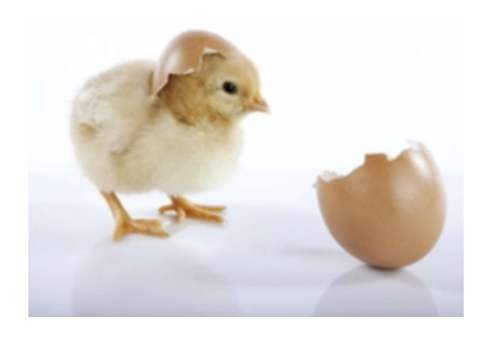
Welcome to our Animal Growth & Development Class!